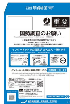
Envelope containing the census form

*They will always carry their official census ID.