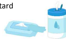
Wet tissue container Wet tissue bag

How to put out plastic packs and wraps for collection