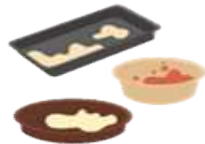
Food packs with stains hard to remove