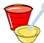
Toothbrushes, Buckets, Washbowls