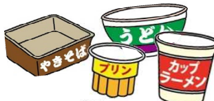
Cups of the cup noodle Cup type boxes for custard pudding etc.