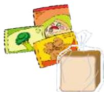
Sacks of cake, bread and frozen foods