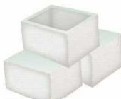
Foaming polystyrol etc