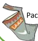
Packs for retort foods