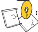
CD, DVD etc.